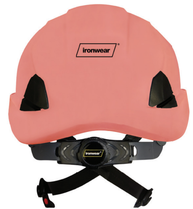
(Back with Ratchet)