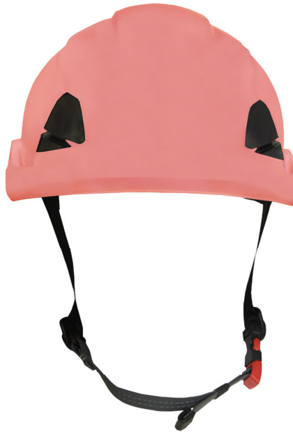
(Front with Chin Strap)